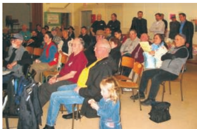
Members patiently endure the club politics