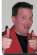
We voted for this guy?!!