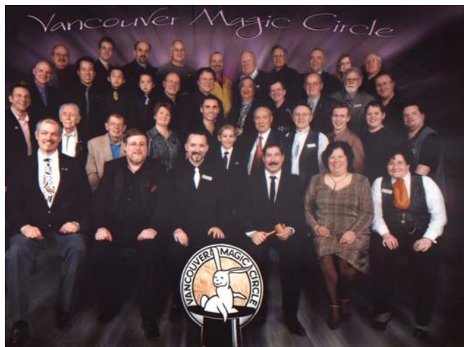
2008 Vancouver Magic Circle Club Photo

Remember, the hotel always offers great rates to our members on these evenings so, if you would like to stay, be sure to mention that you're a part of our group.