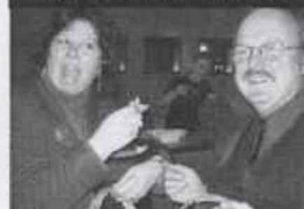
Wacky 50/50 Ticket Sellers