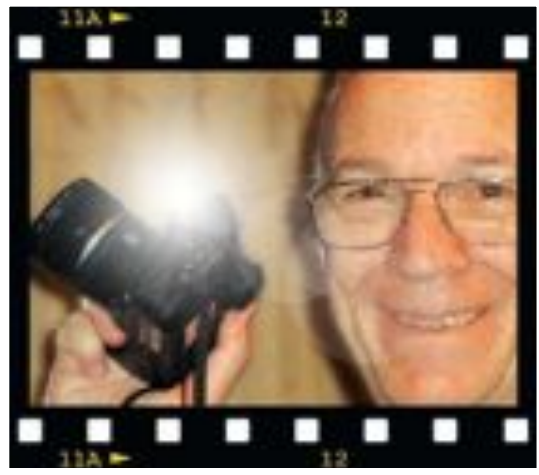
He kind of looks like Jimmy Olson