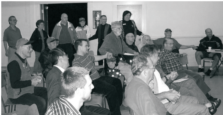
V.M.C. members watch Tip Top & Tootsie competition.

we finished up the meeting on a sweet note.