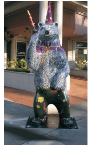
Up for auction: Levitating Spirit Bear www.SpiritBearsintheCity.com