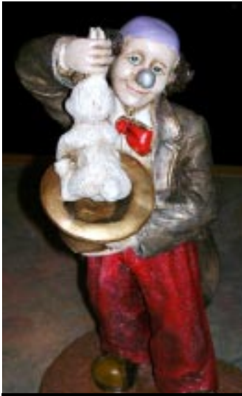
Photo of figurine to be mounted on top of the new TipTop & Tootsie Trophy